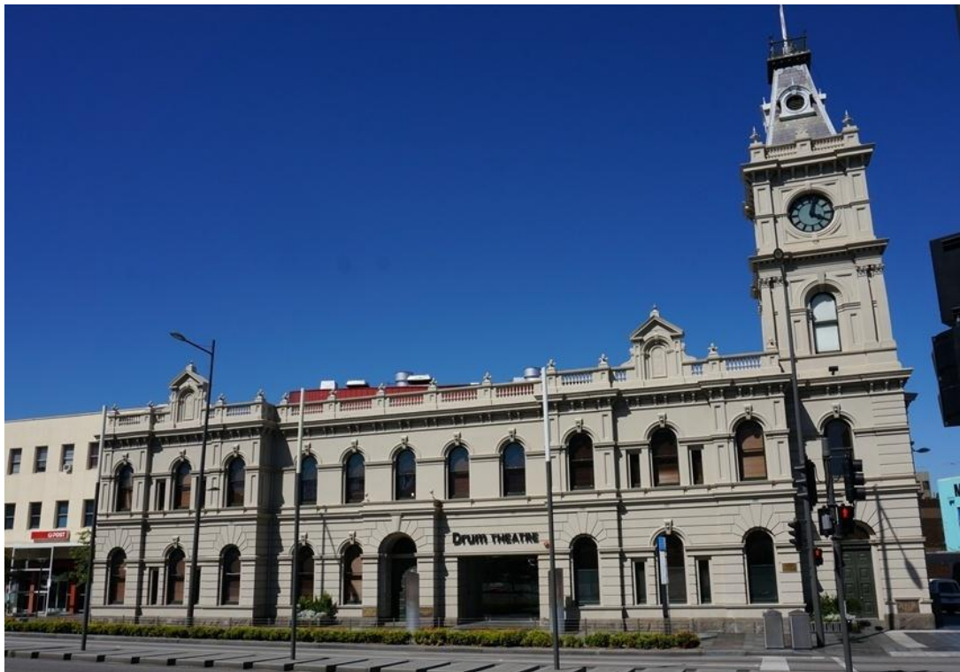
Figure 3 Lonsdale Street (west) elevation.