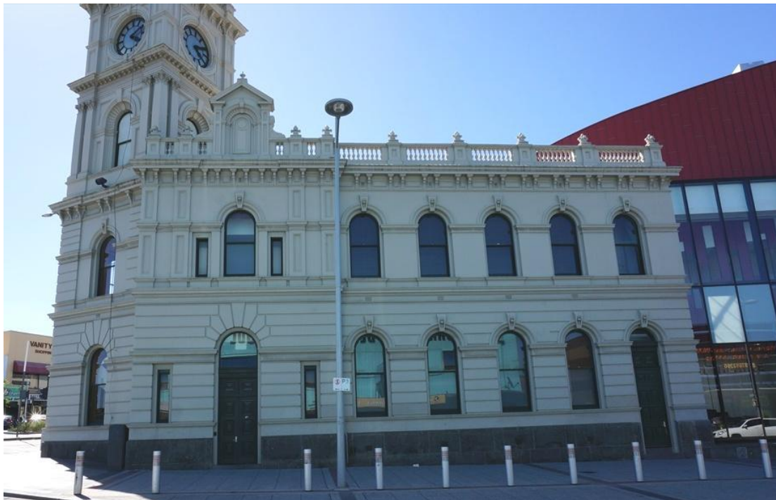
Figure 5 Walker Street façade: detail of remaining 1890 section.