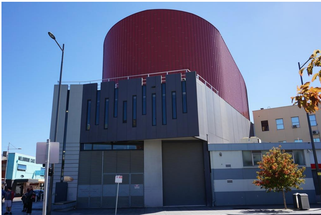
Figure 9 The 2006 Drum Theatre east elevation looking west from Langhorne Street.