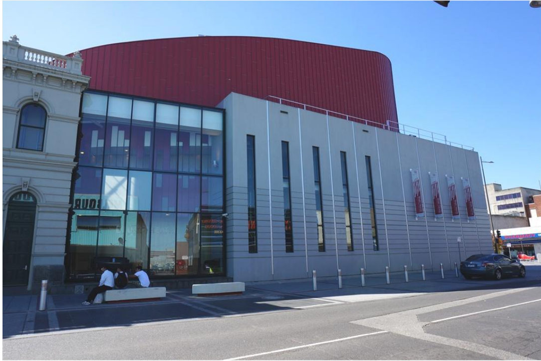
Figure 8 Walker Street façade: 2006 Drum Theatre addition