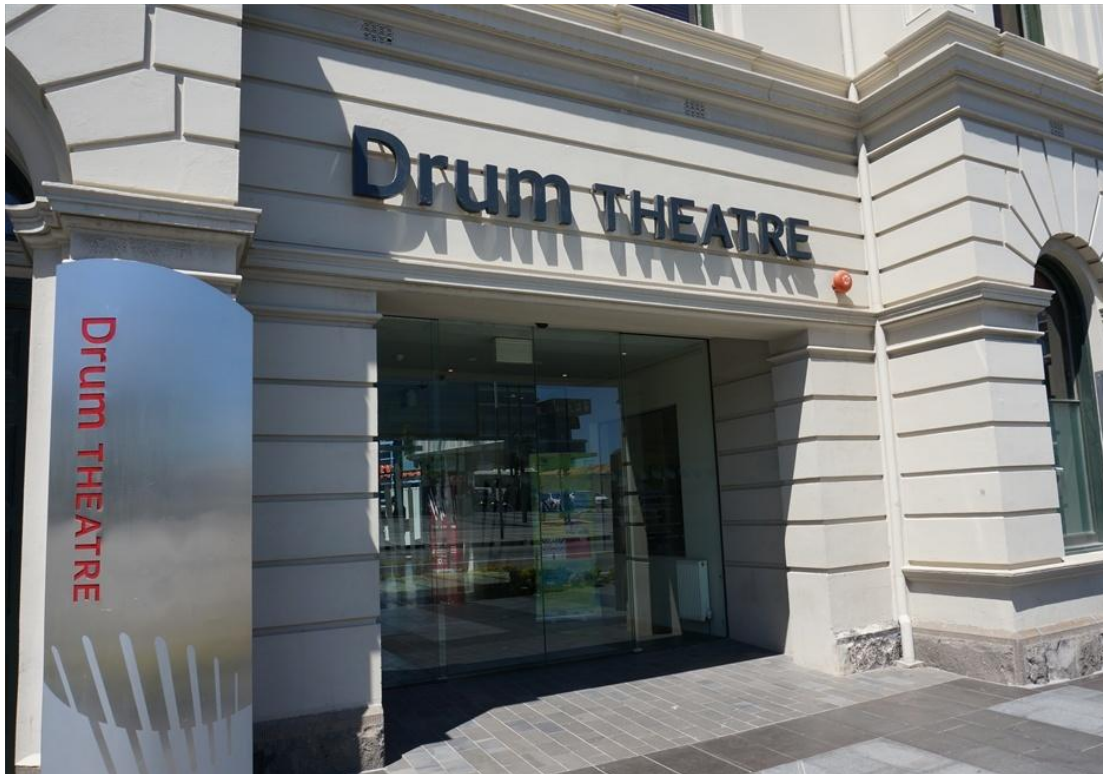
Figure 4 Detail of the 1940 Lonsdale Street entrance. The doors are recent additions.