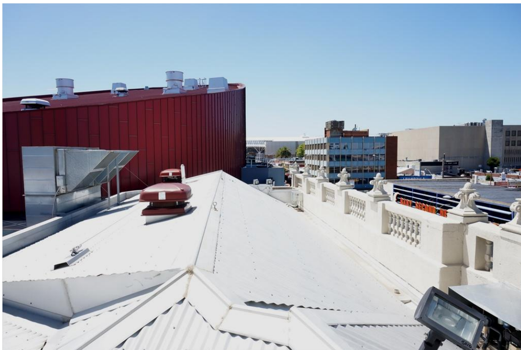
Figure 7 View of the roof looking east. The nineteenth century parapet facing Walker Street is visible to the right and the Drum Theatre extension to the left.