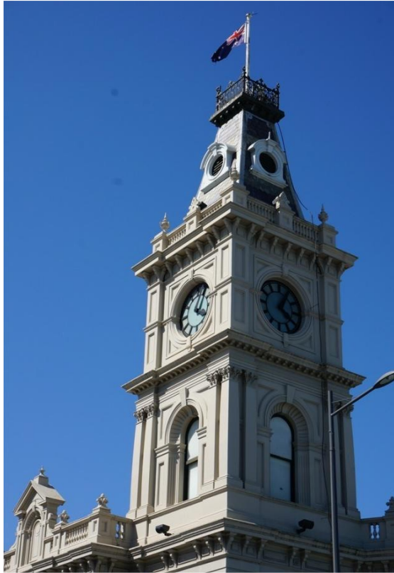
Figure 6 Detail of clock tower